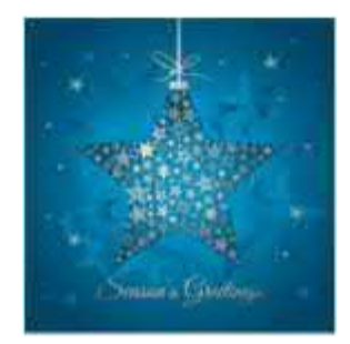
Decorative Star "Warmest Greetings of the Season and every good wish for the Coming Year"