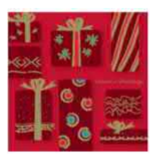
Presents "Best Wishes for a Merry Christmas and a Happy New Year"

Click the item to view online and place your order