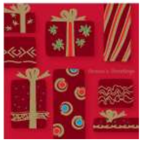
Present Cards "Best Wishes for a Merry Christmas and a Happy New Year"

Christmas is nearly here and we have some amazing Christmas cards, hand made puddings and Santa approved stocking stuffers on sale! All proceeds go to helping people living with MND and their families. You can order online or call us on 02 8877 0999