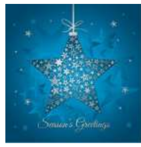
Star Cards "Warmest Greetings of the Season and every good wish for the Coming Year"